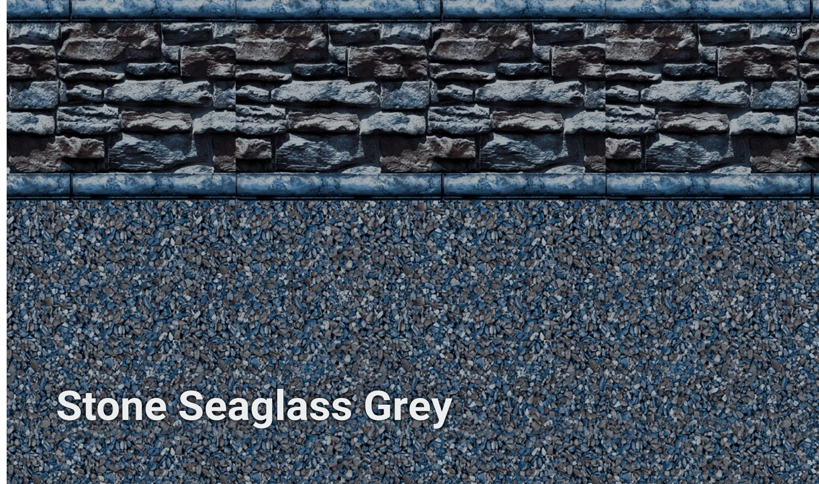
Stone Seaglass Grey