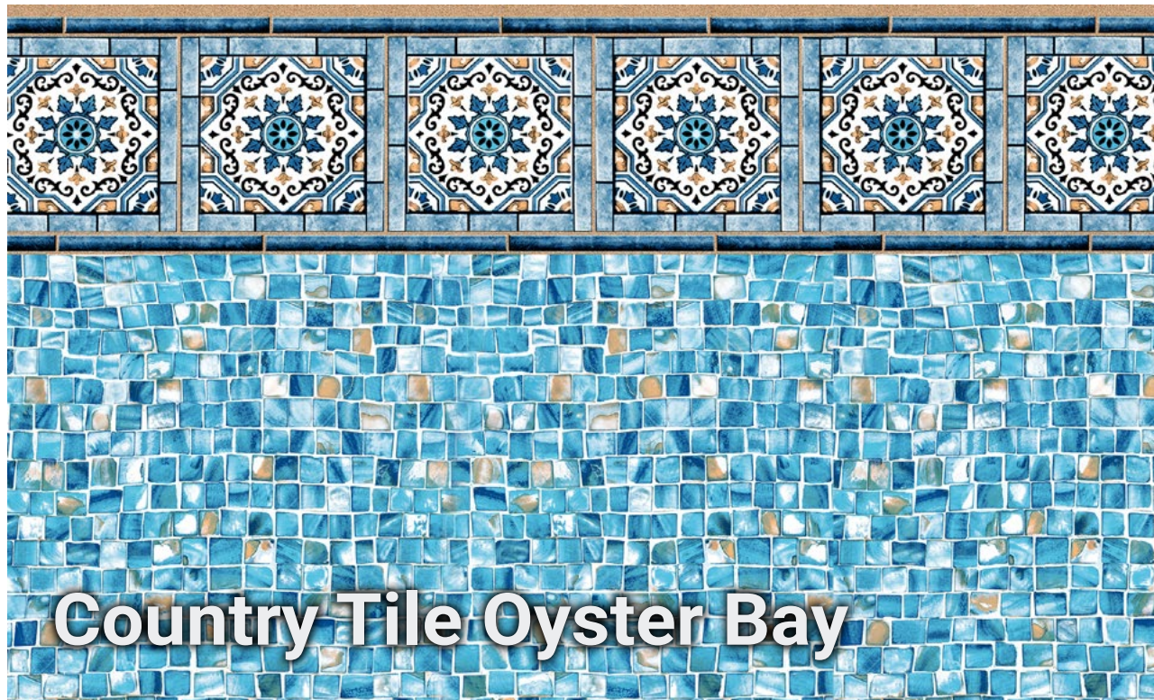
Country Tile Oyster Bay